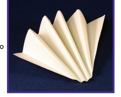
Cellulose grades are available in fluted formats.